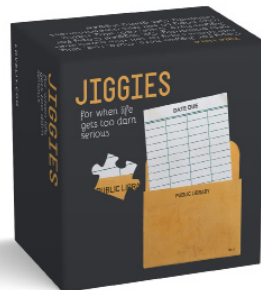
LIBRARY CARD JIGGIE PUZZLE

$13.00 U.S. nonreturnable 85-Piece Die-Cut Puzzle 60+ minute difficulty Approximately 8 1/2 x 8 1/2 in finished size Box: 3 1/2 x 3 1/2 x 2 1/2 in 2 per design minimum