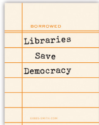
LIBRARIES SAVE DEMOCRACY

$4.00 U.S. nonreturnable About 3 1/2 x 4 1/2 in die-cut vinyl Stickers only sold in quantities of 6 per design Made in the U.S.A.