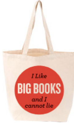
I LIKE BIG BOOKS