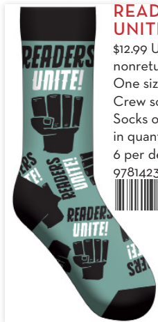
READERS UNITE SOCKS

$12.99 U.S. per pair nonreturnable One size fits most, Crew sock length Socks only sold in quantities of 6 per design