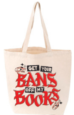
GET YOUR BANS OFF MY BOOKS