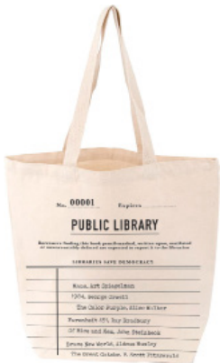
LIBRARIES SAVE DEMOCRACY 9781423663843

$25.00 U.S. nonreturnable 16 in wide x 15 1/2 in tall x 5 in gusset Natural cotton, 22 in handles 3 bags per design minimum Made in the U.S.A.