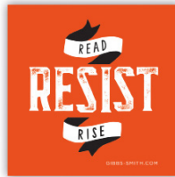
READ RESIST RISE