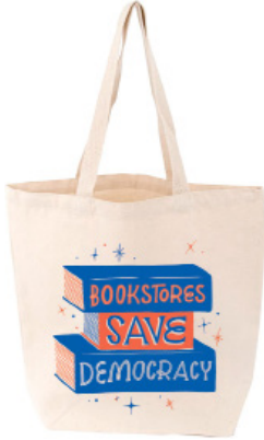
BOOKSTORES SAVE DEMOCRACY!