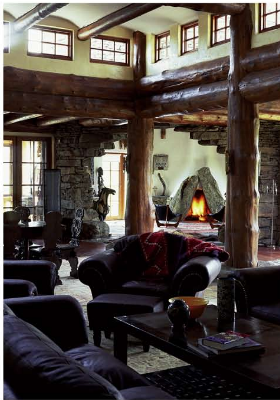
Four views of the large living room complete with massive leather armchairs and sofas. The seating arrangement was constructed in Victoria, South Africa, and covered with kudu hides. The antique dining room set of table and six chairs are Spanish, from the twelfth century. The overall decor is an extensive collection of both African and Asian/Oriental antiques.