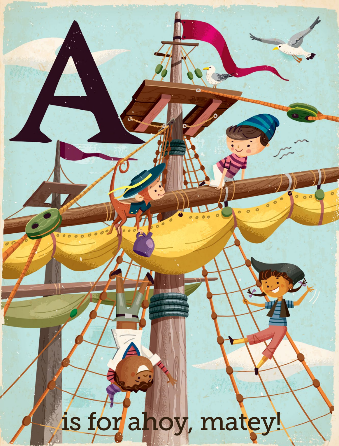
A is for ahoy, matey!