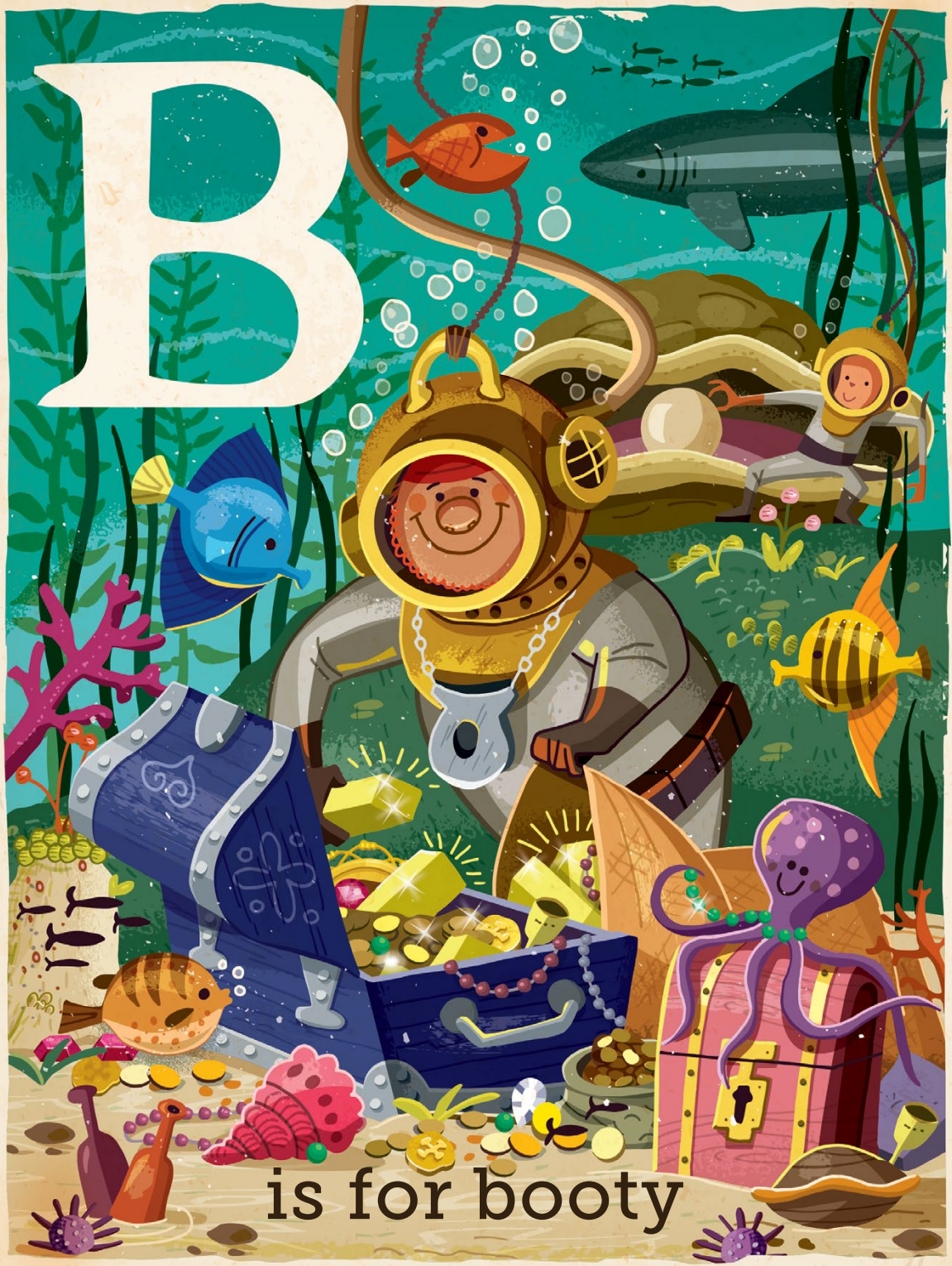
B is for booty