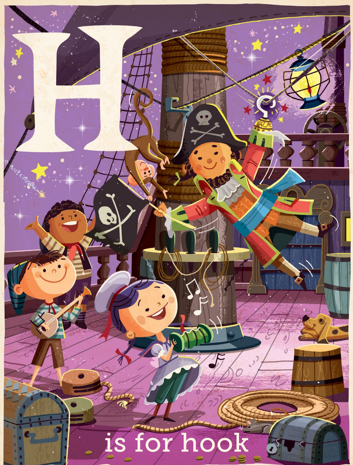
is for hook