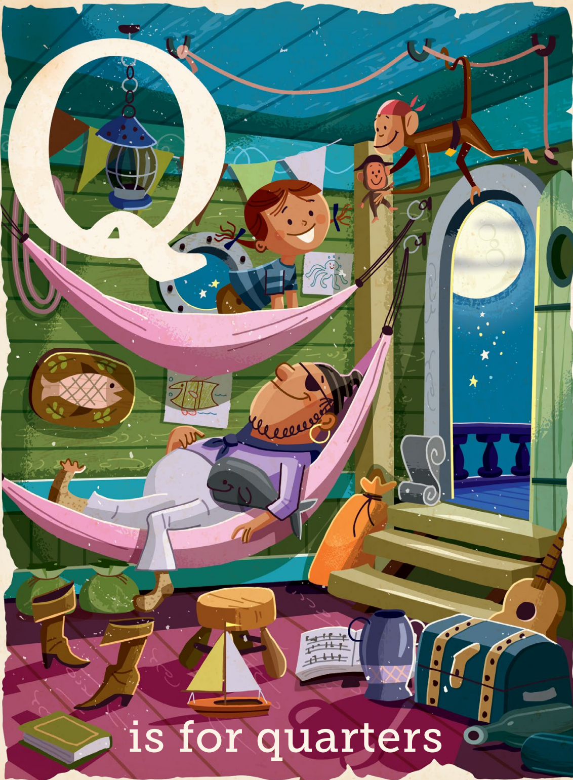
is for quarters