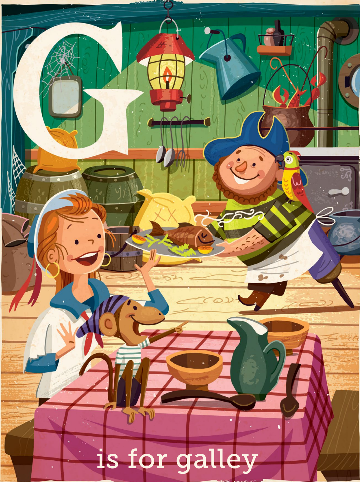
is for galley