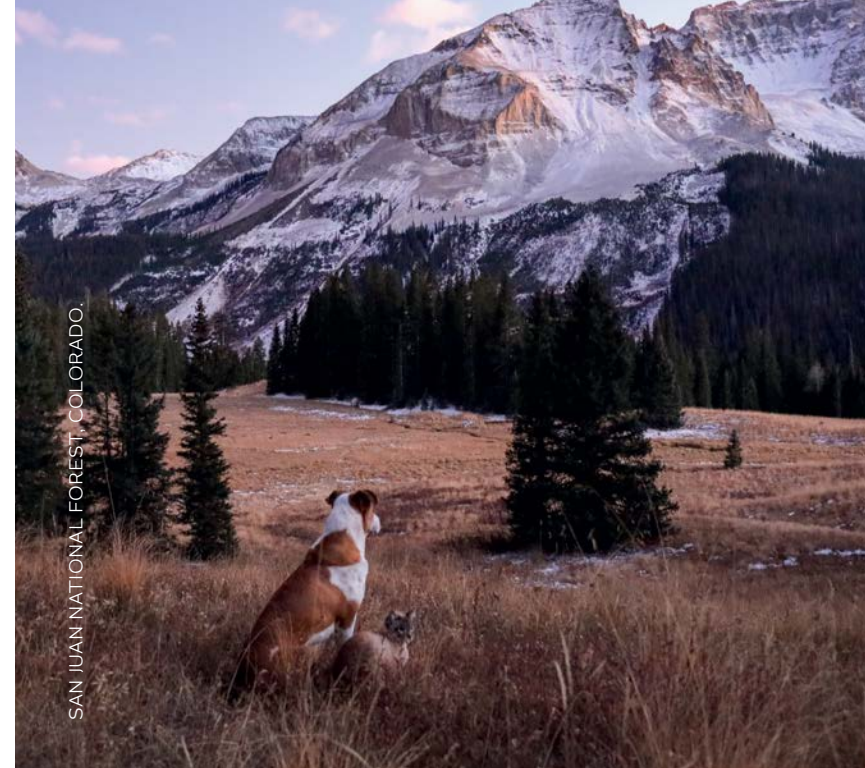
SAN JUAN NATIONAL FOREST, COLORADO.