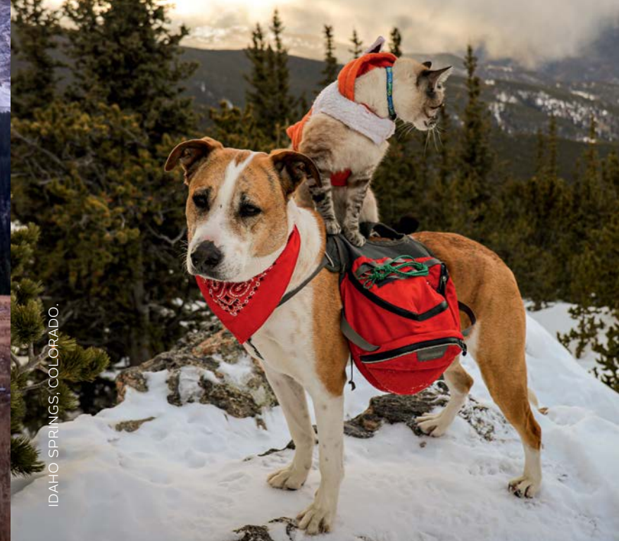
IDAHO SPRINGS, COLORADO.