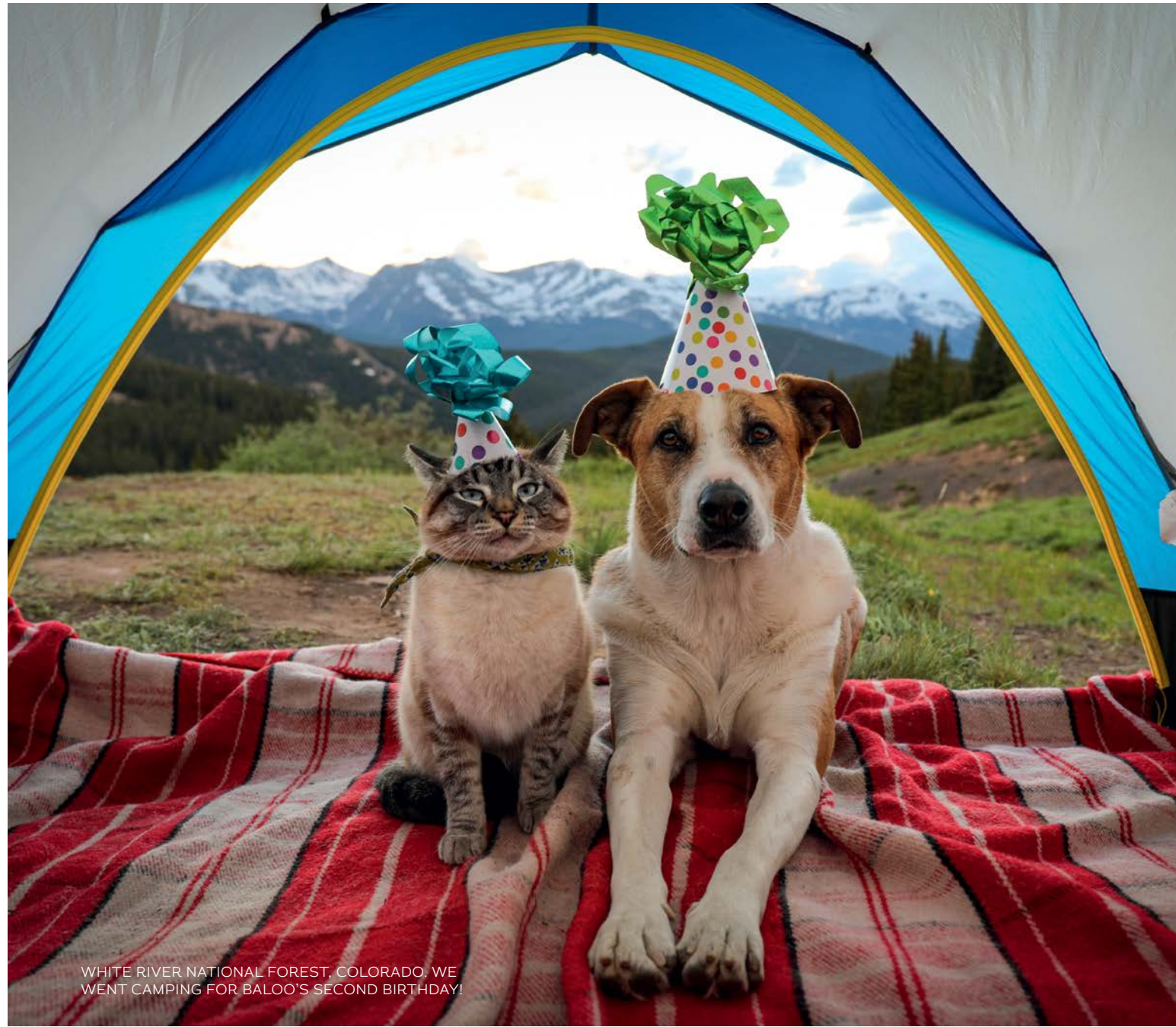
WHITE RIVER NATIONAL FOREST, COLORADO. WE WENT CAMPING FOR BALOO'S SECOND BIRTHDAY!