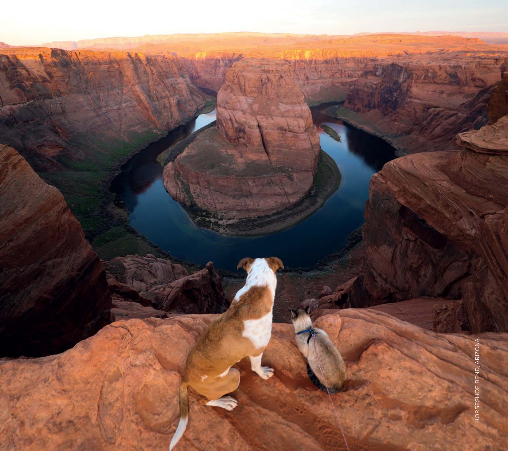
HORSESHOE BEND, ARIZONA.