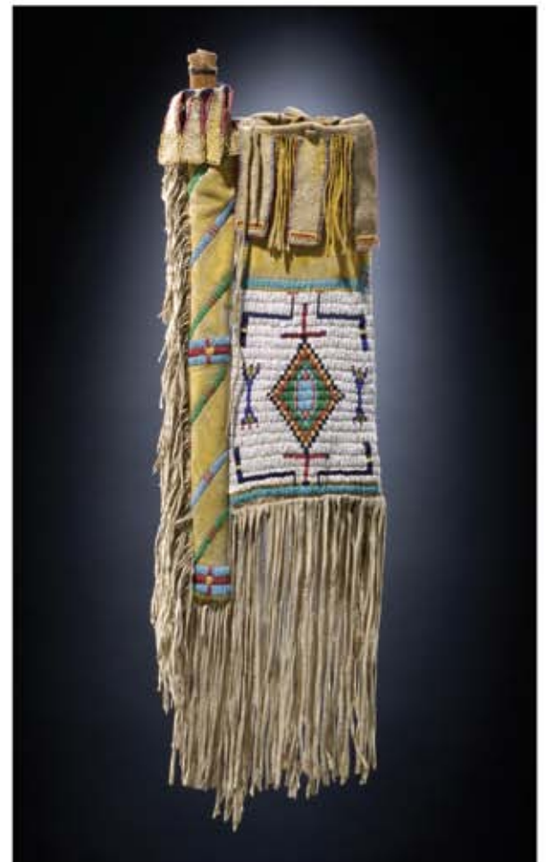
Tobacco Bag, Pipe Stem Case and Pipe Stem, c. 1875 Ute, Colorado or Utah Bag: Native leather, glass beads, pigment Stem: Wood, stone 33 x 8 1/2 inches