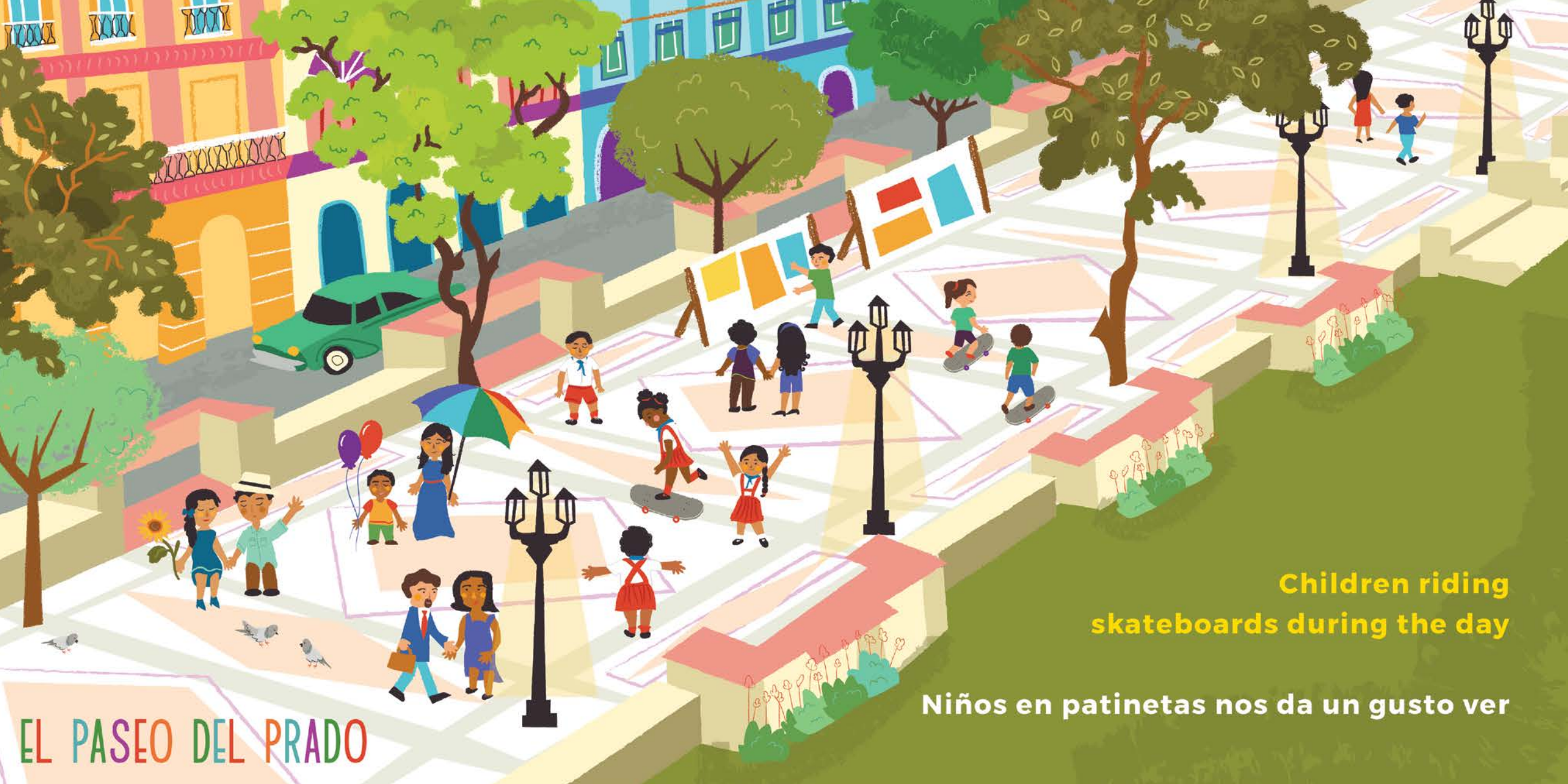
Children riding skateboards during the day