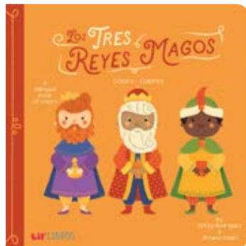
TRES REYES MAGOS/THREE WISE MEN: COLORS/COLORES 978-1-947971-10-3