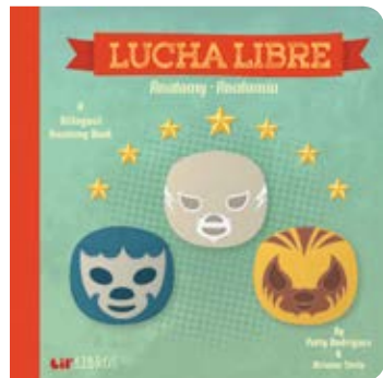
LUCHA LIBRE: ANATOMY/ANATOMÍA 978-0-9861099-1-1

Expand your world with Lil' Libros board books, a new series of colorful and cultural books that inspire parents to read to their child at the earliest age. These delightful baby books use a simple format to introduce the littlest readers to first concepts such as numbers, colors, and body parts—all while tying in a prominent person or theme from Latino culture. Perfect for multilingual households, as well as for parents and siblings who want to learn Spanish alongside their little one.