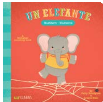
UN ELEFANTE: NUMBERS/NÚMEROS