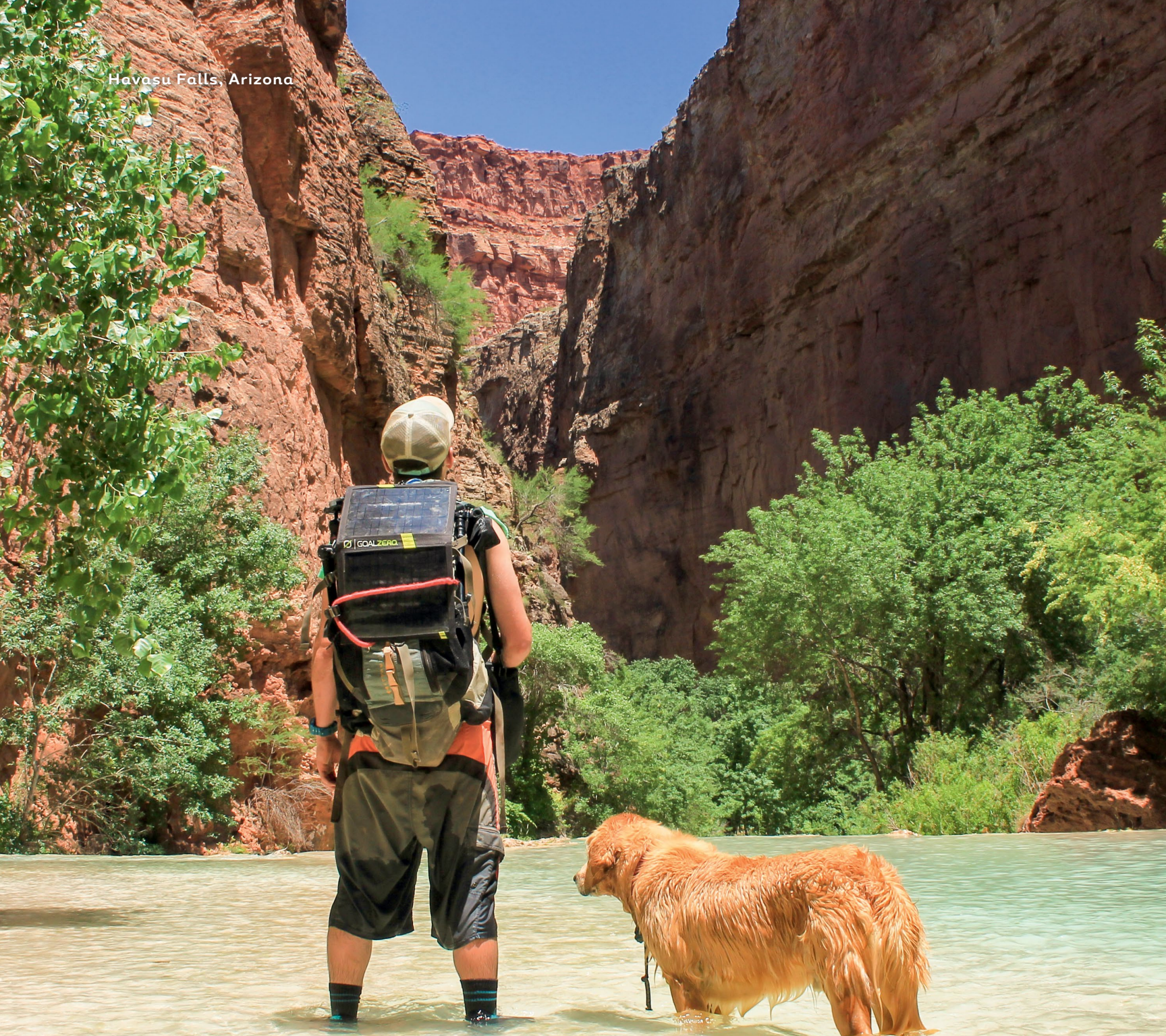
Havasas Falls, Arizona