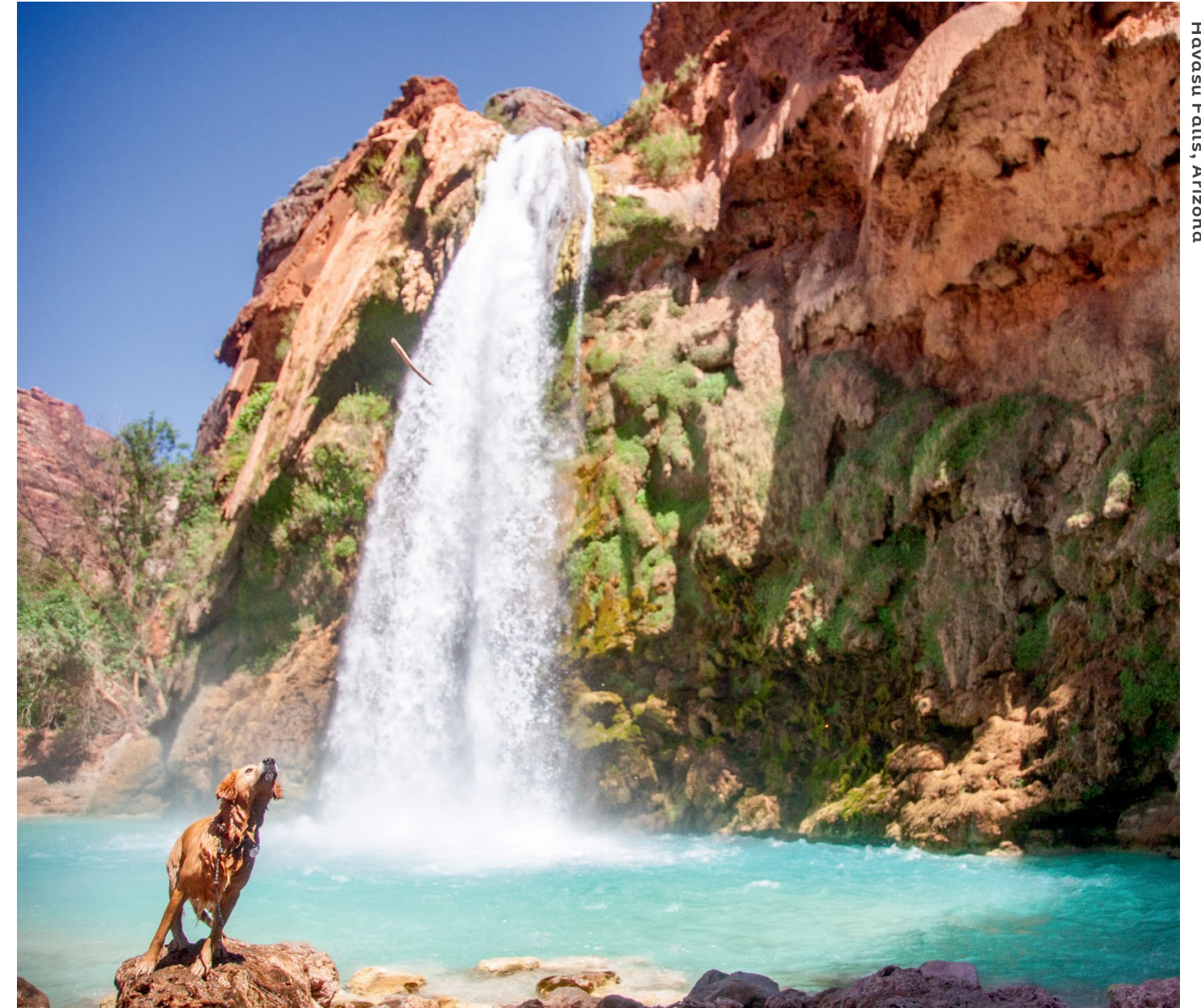
Havasas Falls, Arizona