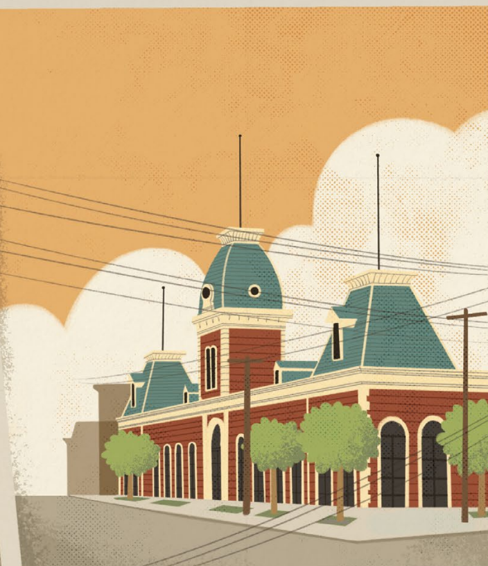
"Aduana" Mexican Custom House / Ciudad Juárez, Chihuahua.