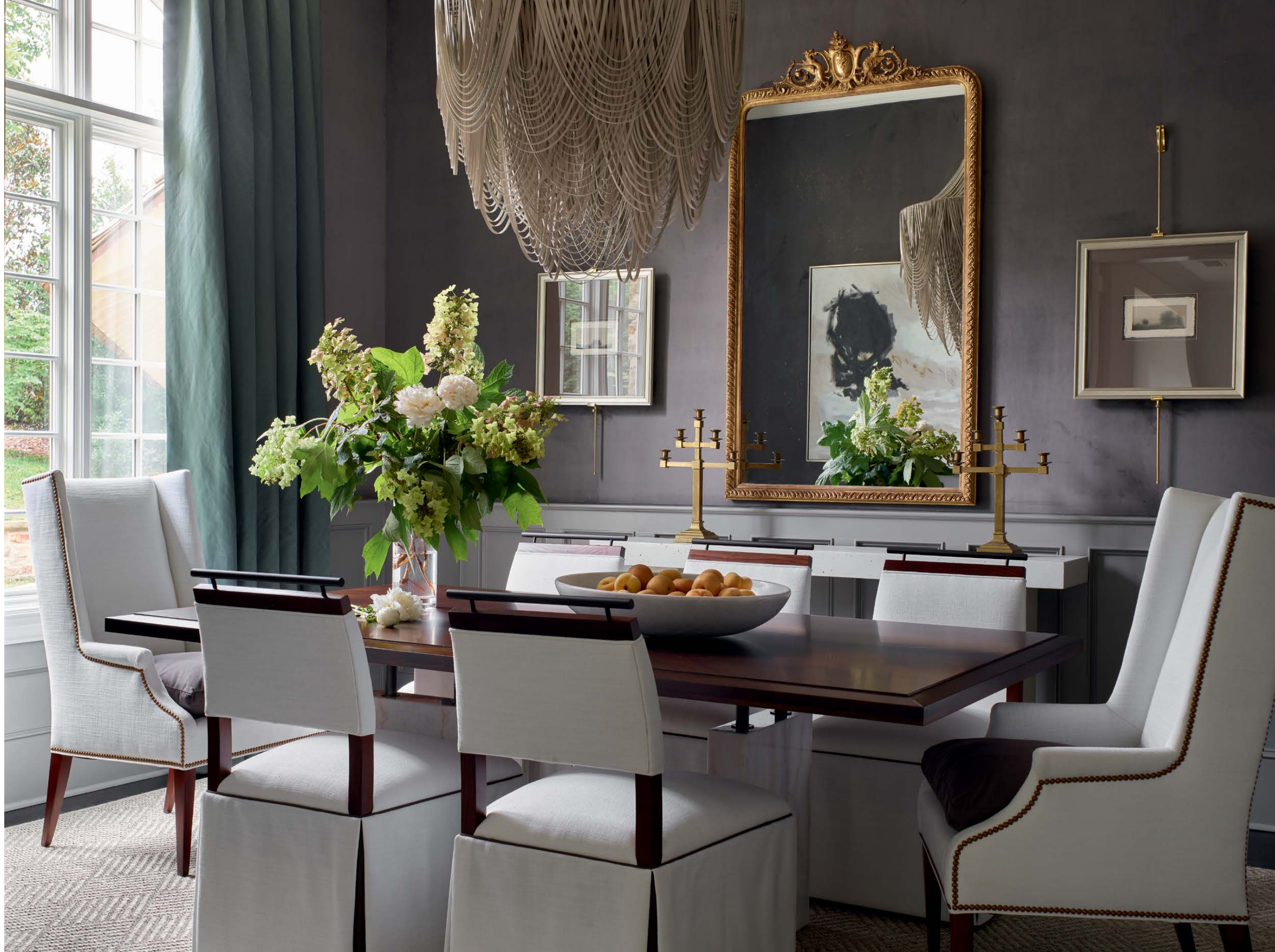
A mix of finishes, including a wooden table with a marble base, a textured wall covering, a vintage gilded mirror, and a custom concrete console table keep the eye engaged in the dining room.