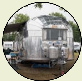
Rounded aluminum aircraft-style construction