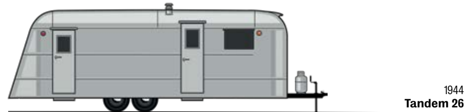
1944 Tandem 26

Liberty Coach Company was an offshoot of the Elcar Coach Company (see page 104). Their bread loaf–style coaches were marketed to World War II defense workers and later to families. They had an exclusive “three decker heated floor” and a ventilation system that moved warm air evenly throughout the trailer.