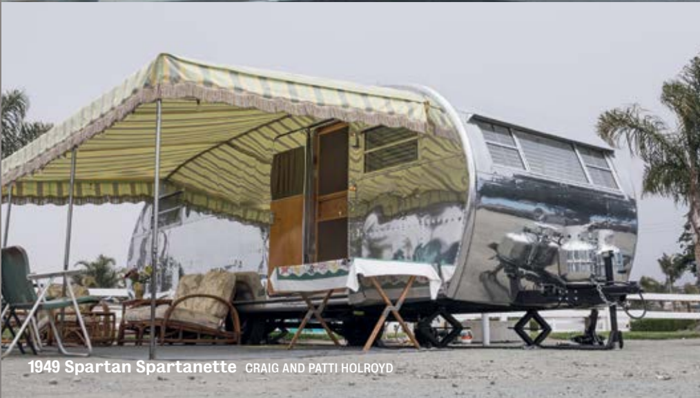
1949 Spartan Spartanette CRAIG AND PATTI HOLROYD