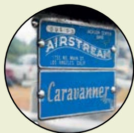
Badges that identify the brand, model, and/or interior package