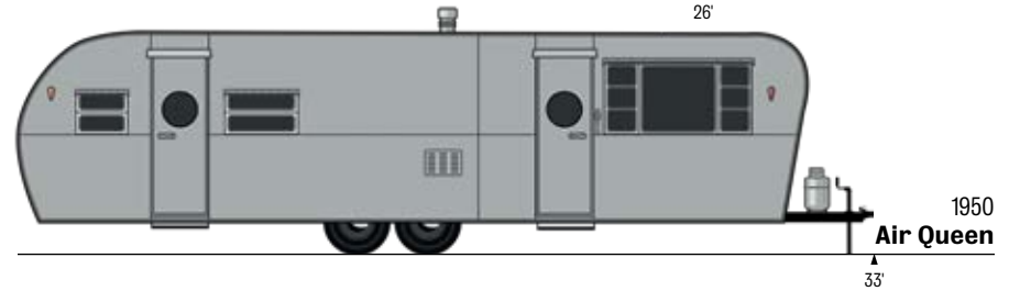
1950 Air Queen 33'