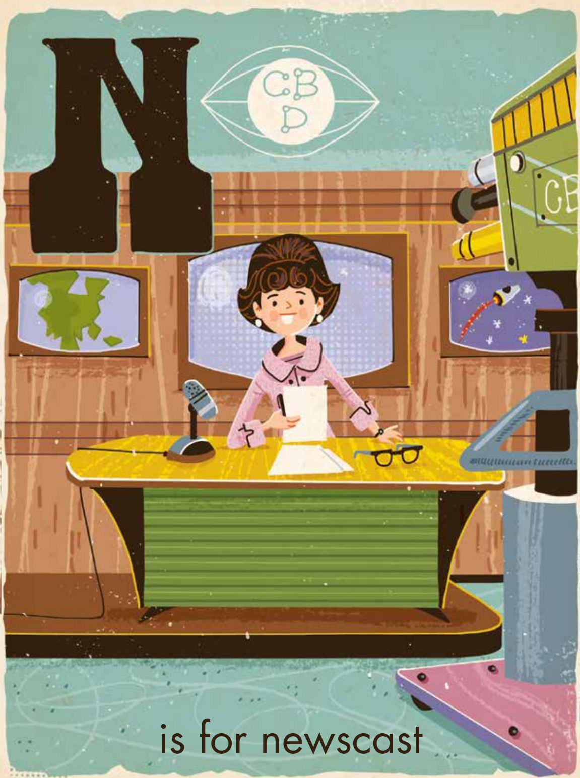
is for newscast