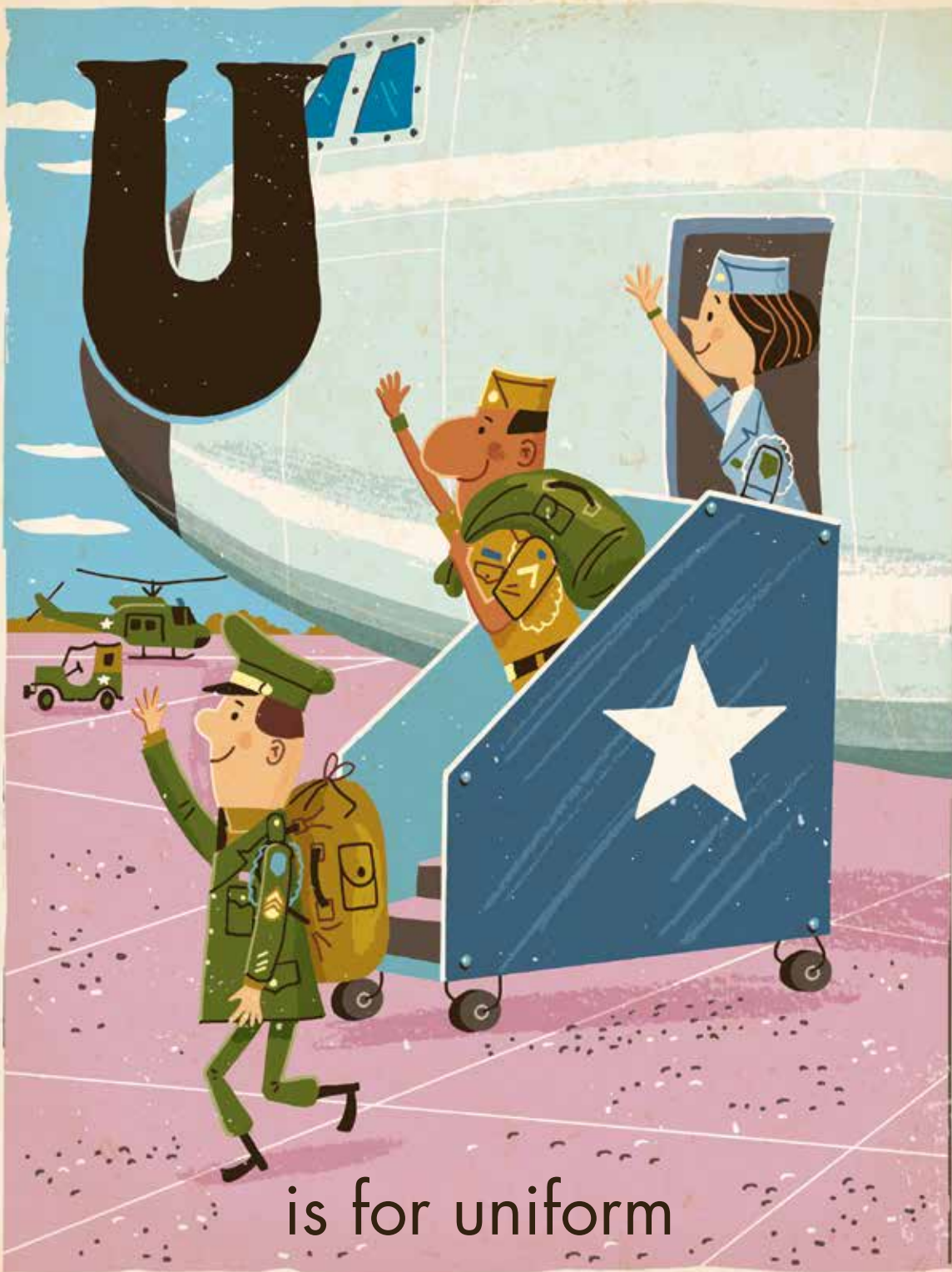
is for uniform