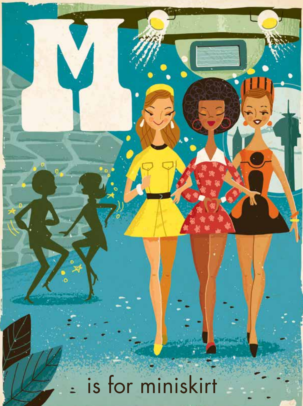
is for miniskirt