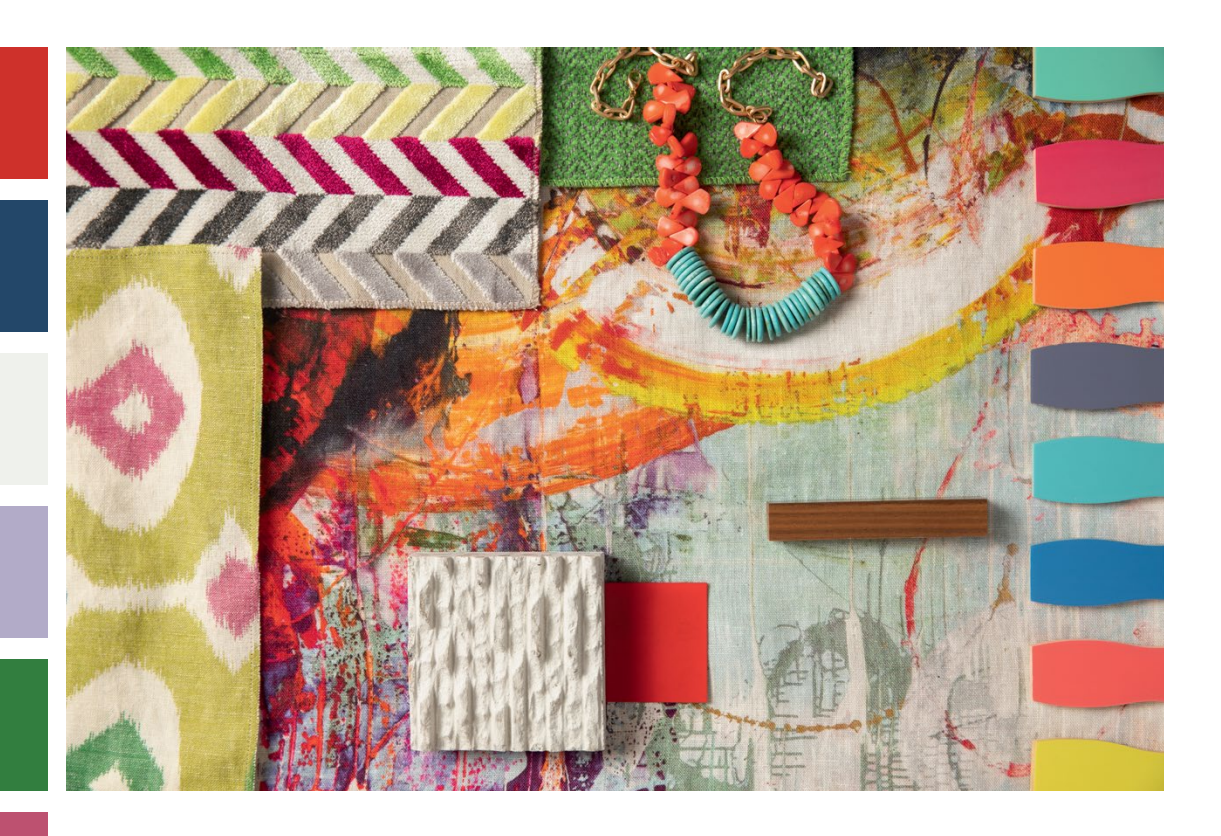
BENJAMIN MOORE PAINT COLORS, FROM TOP: Vermilion 2002-10, Downpour Blue 2063-20, Simply White 2143-70, Crocus 1404, Vine Green 2034-20, Royal Fuchsia 2078-30.

My own Sewickley, Pennsylvania, home is a convergence of all my favorite design lessons: color, pattern, modern-meets-traditional, and, with four busy kids, a whole lot of functionality. The way we landed on this house, though, was a bit of a surprise. We had just finished renovating another house. I was out jogging and saw a "For Sale" sign. I've lived in this area my whole life and had never noticed this property. So, I ran up the driveway, and there was a very ordinary 1970s structure—but it was on a beautiful lot. I fell in love with the piece of land, and we purchased it. After the Great Recession hit, though, we put off renovations, and this allowed us time to live in the home and see what we needed to change. We finally moved in the night we had our youngest daughter, Marlowe.